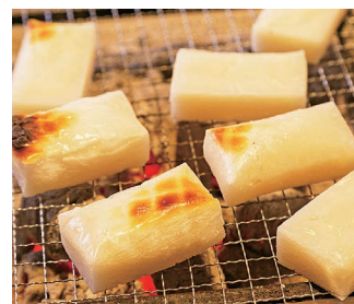
Mochi (Rice Cake)